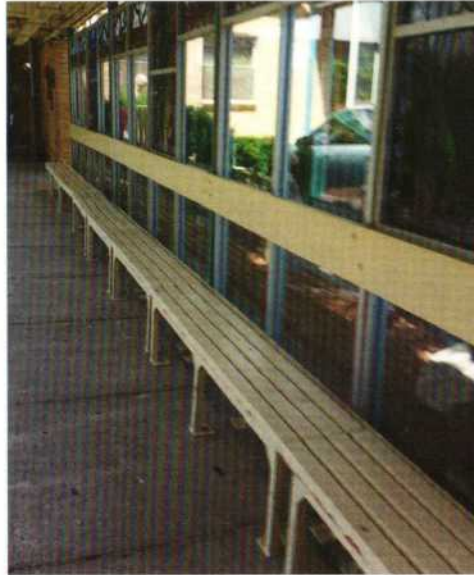
The Empty Seats