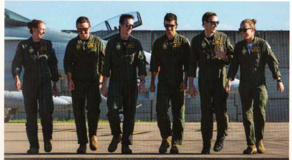
The female fighter pilots flank four of their male colleagues as graduates of the RAAF's grueling fast-jets course

If there was any hint of a glass ceiling in the Royal Australian Air Force, two women just flew straight through it.