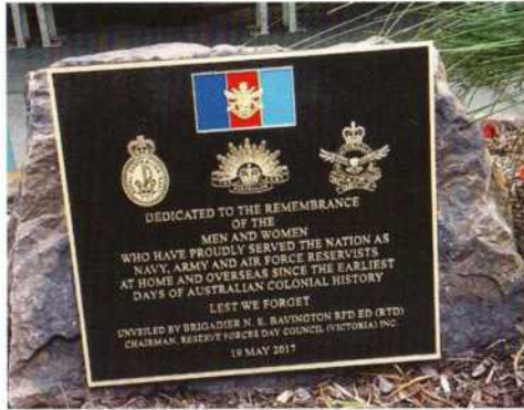
Reserve Forces Plaque

so graciously as we walked pass to collect our tributes with the promise to catch up later in the Acacia Room for that welcome cuppa.