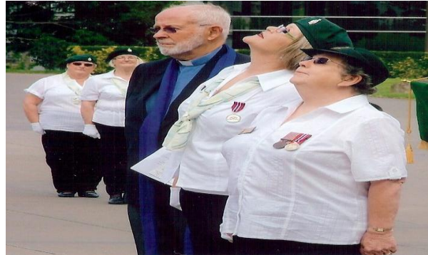
Patron, President and Chaplain observing WRAAC Flag raising