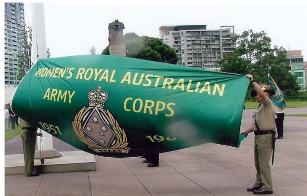
Shrine Staff Raising the Flag