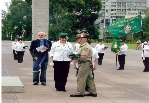
Flag in the care of the Shrine of Remembrance