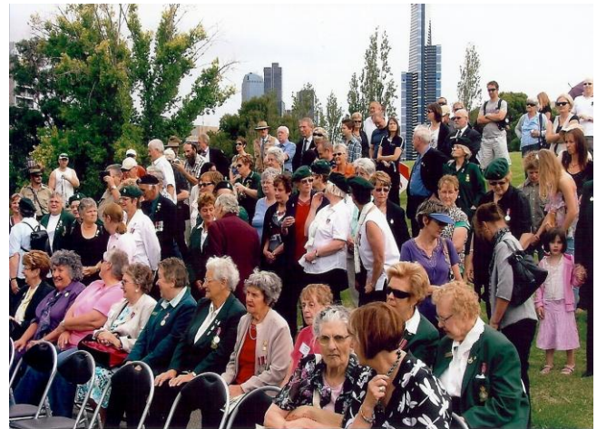
Family and Friends