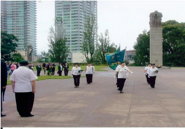
Escort and Flag Party