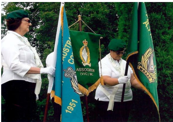
WRAAC Standard, Banner and Flag