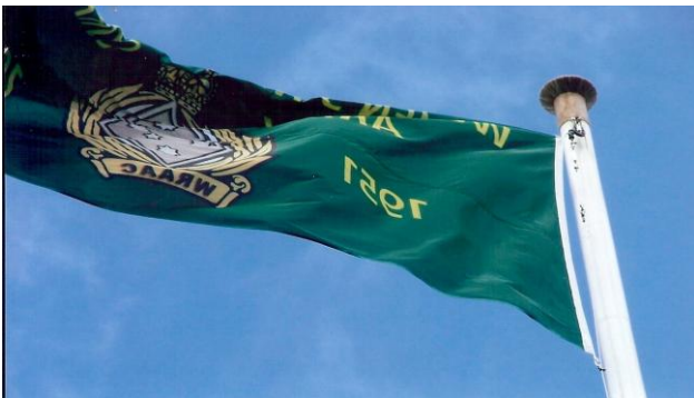
WRAAC Flag flying high