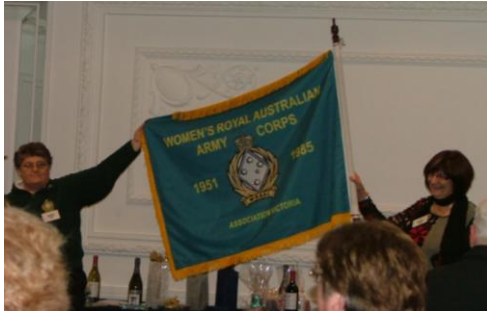
WRAAC Standard on display