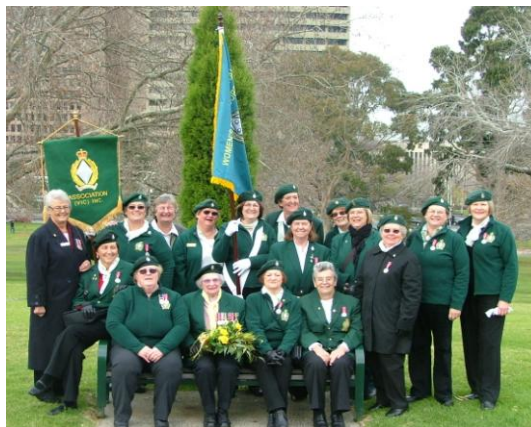
At WRAAC Plaque following Reserve Forces Day Parade.

As former Servicewoman you never forget the girls you served with and our Plaque at the Shrine of Remembrance enables us to reflect on a time when we were all together.